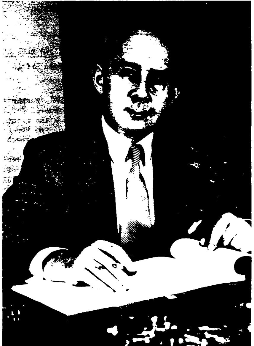
At his desk at Headquarters

Real encouragement for the new organization was to arrive next with the announcement of four countries that they would make voluntary contributions to UNICEF on a yearly basis: the United States which in that first year gave $15 million, Canada which donated $5 million, France $168,000 and tiny Luxembourg, $2,000.